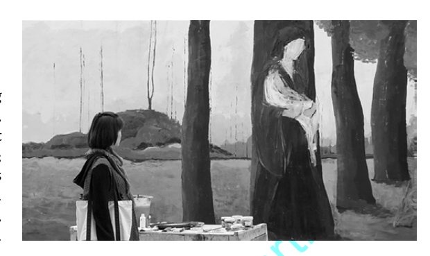
Fig. 11: As Xiaoyang contemplates the mural, her figure is lower than but aligned with the Virgin Mary's; the composition emphasizes their marked resemblance. WAITING FOR GOD (Gan Xiao'er, CN 2012), 00:28:52.