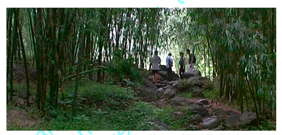
Fig. 2: From a distance the viewer sees the parents take leave of their child and the buyers. THE ONLY SONS (Gan Xiao'er, CN 2002), 01:20:00.

While a long shot is often used to create a relaxing, poetic feeling and a close-up shot to create a shocking, striking effect, in some key sequences in the family's demise, the more intense the emotional pain, the farther away the camera. For example, when the baby is taken away, Ah Shui and Qiu Yue follow the buyers. A long shot depicts this scene as if it is a common event, simply hosts seeing their guests out (figs. 1 and 2). Qiu Yue neither cries nor acts hysterically. Her sad face appears behind the bushes for only a moment, and then it disappears. There is little rendering or camera movement. The rhythm is slow, and the soundstage is clean. The camera calmly outlines the characters' actions. No matter how important the scene or