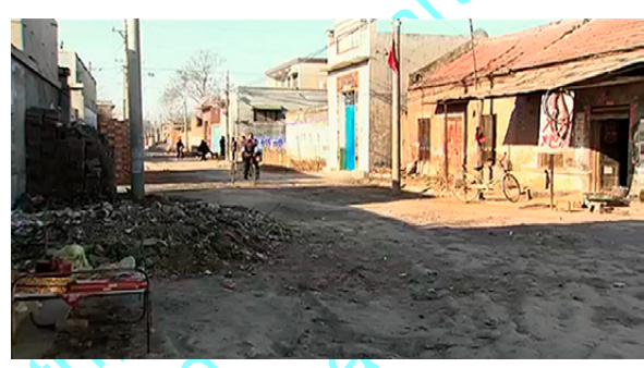
Fig. 4: Xiaoli rides her tricycle through the village. RAISED FROM DUST (Gan Xiao'er, CN 2007), 00:05:39.

keep their real names in the film and act out their actual lives. Moreover, Gan continues his preference for a static camera, combining long takes with deep-focus cinematography. With these choices Gan is following the line of the post-socialist realism found in China in the early 1990s in both documentaries and fiction films.35