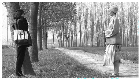
Fig. 8: On a country road, Xiaoyang and the Buddist nun meet each other as equals. WAITING FOR GOD (Gan Xiao'er, CN 2012), 00:20:36.

when Xiaoyang is talking to Miriam, she seems pushed to a corner in the frame (fig. 7), whereas in her meeting with the nun, the two figures are in a symmetrical position on the screen (fig. 8). This brief encounter suggests Gan's openness to comparative religion and his interest in interreligious dialogue.